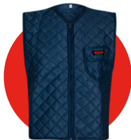
RABECA 2170 Art. no. 2.52.170.00