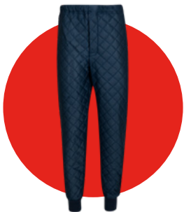
RACHEL 3070 Art. no. 2.53.070.00